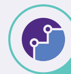
IDE DOSE CHART

Think of this appointment as your launchpad: This is where you get your child's treatment off the ground and on its way.